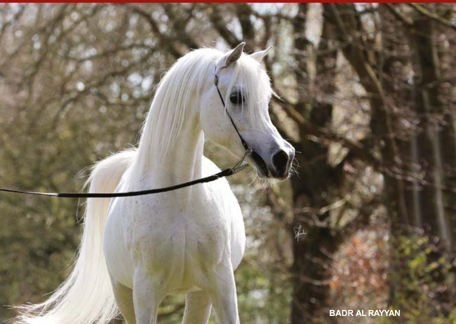
BADR AL RAYYAN