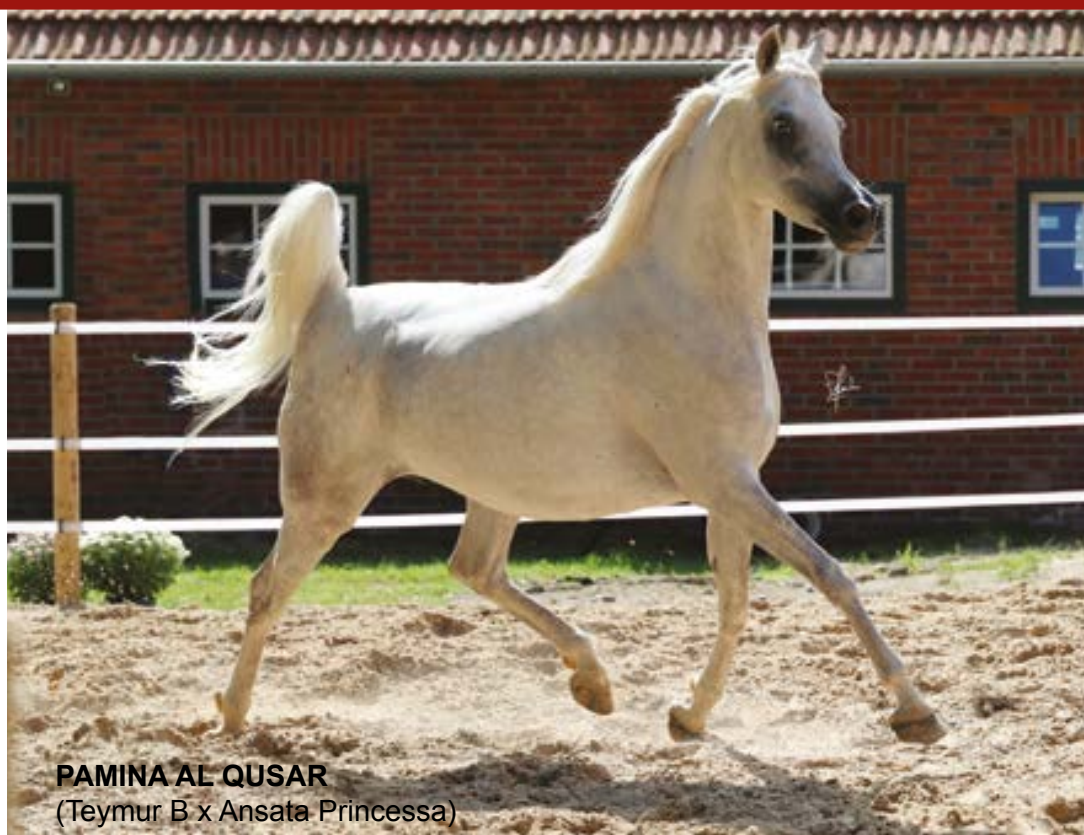
PAMINA AL QUSAR (Teymur B x Ansata Princessa)

are easy to ride, intelligent and willing to perform. He himself was champion stallion at the stallion licensing and has also had much success at shows in his younger years.”