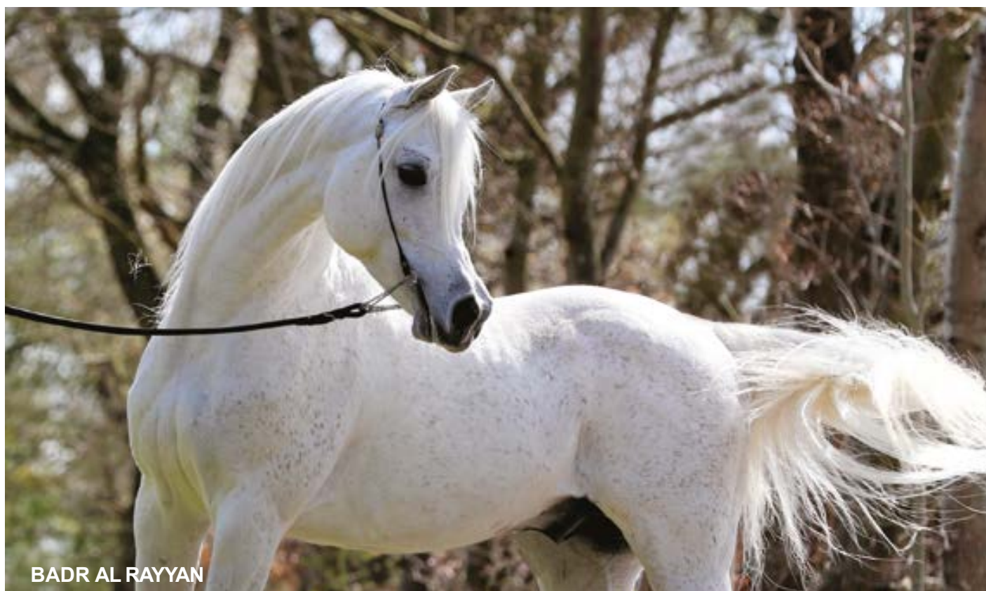
BADR AL RAYYAN