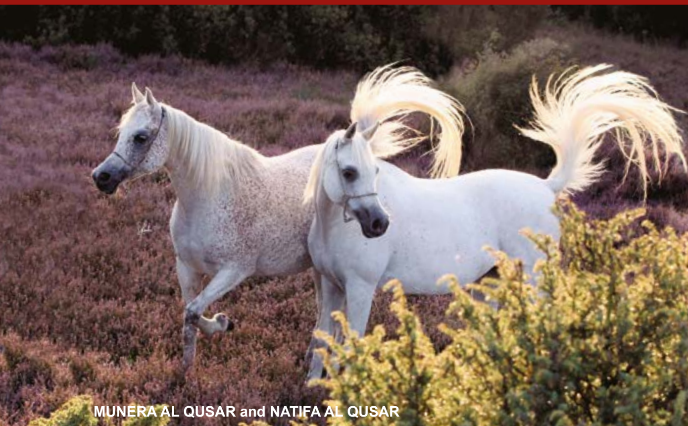
MUNERA AL QUSAR and NATIFA AL QUSAR

AL QUSAR ARABIANS is a stud of the classical horse breeding tradition. Straight Egyptian purebred Arabians have been bred there for almost 30 years. Some of the offspring have found a home in the largest stud farms in Europe and the Middle East and have had a positive influence on international breeding. Al Qusar Stud is located not far from Bremen, embedded in the green world of horse breeding in Lower Saxony, in the north-west of Germany.