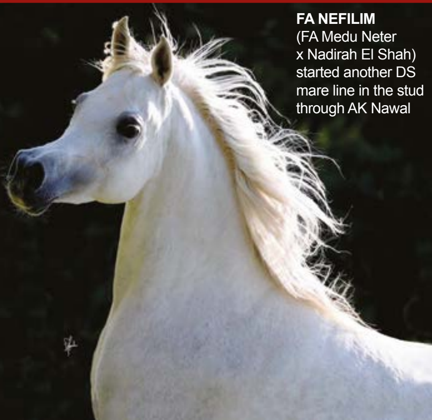
FA NEFILIM (FA Medu Neter x Nadirah El Shah) started another DS mare line in the stud through AK Nawal