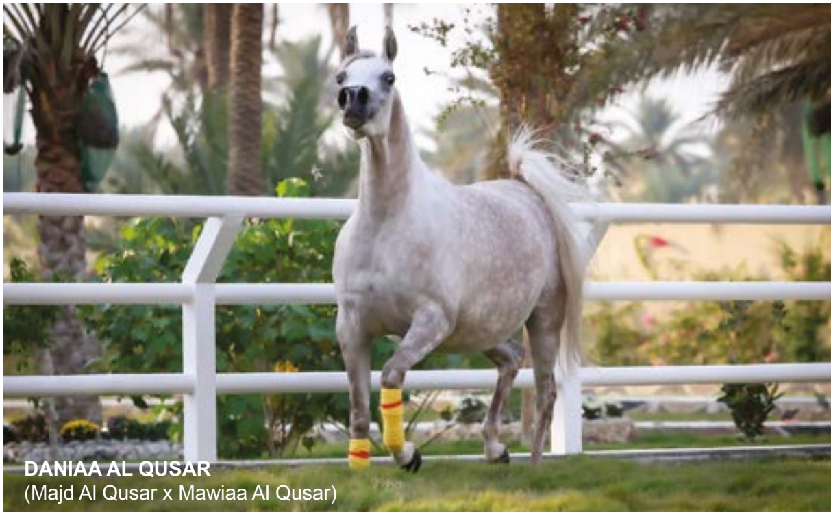
DANIAA AL QUSAR (Majd Al Qusar x Mawiaa Al Qusar)

Majd Al Qusar has an excellent character, just like his grandfather Teymur B. He is honest and gentle and loves to show off his good movement and charisma.