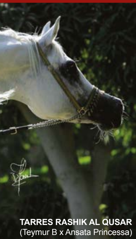
TARRES RASHIK AL QUSAR (Teymur B x Ansata Princessa)