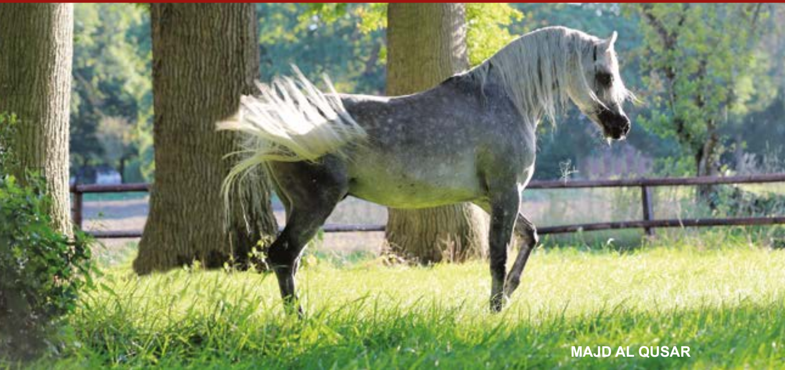
MAJD AL QUSAR

And so it happened that he remained at the stud and now one can see his very beautiful offspring with their inherited good characteristics.